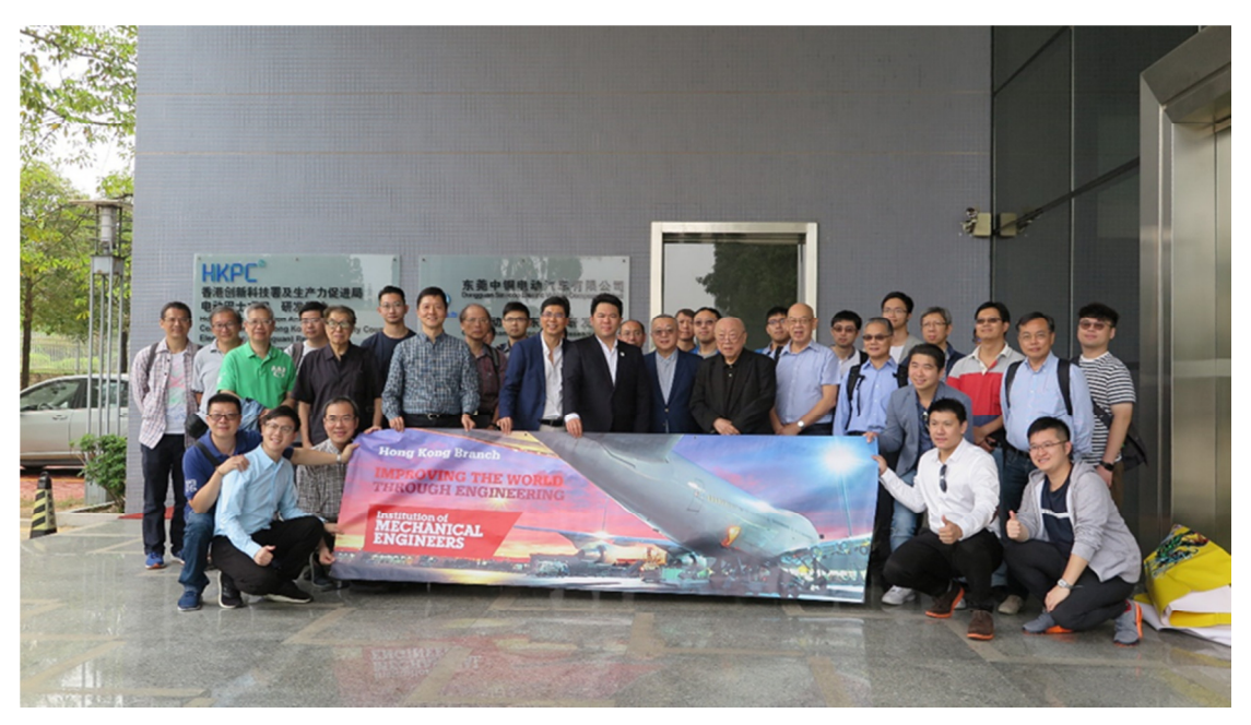
Figure 3 Delegation at China Dynamics